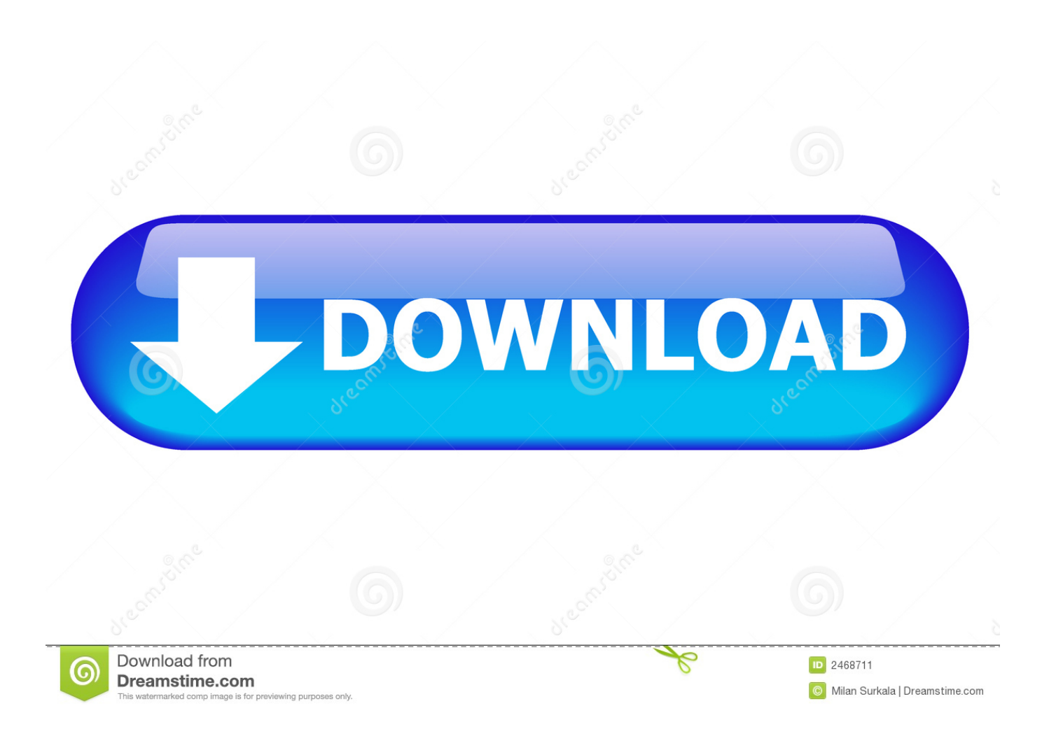
WinZip V.11.1 With Keygen Setup Free